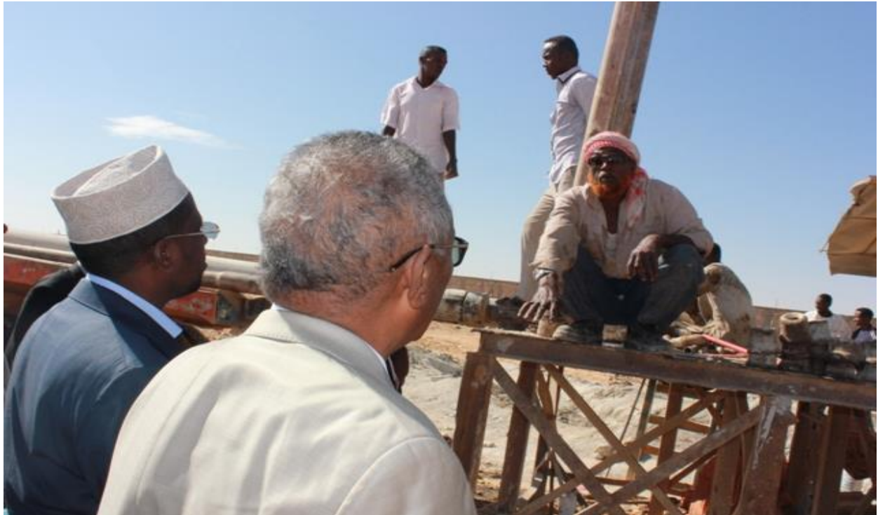
Somalia Presents left punt land president right and Nuwaco head Driller and (operators)