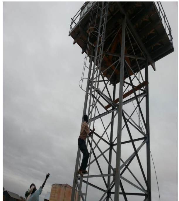
Elevated Steel Water tank Construction Four locations in puntland