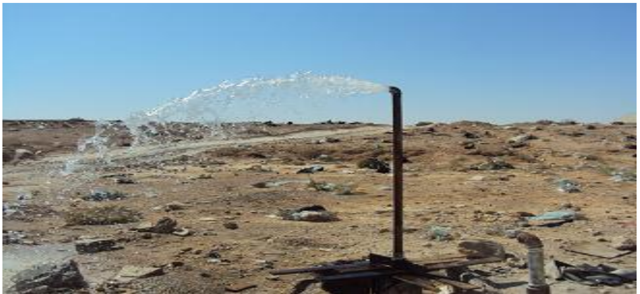
Pump test process