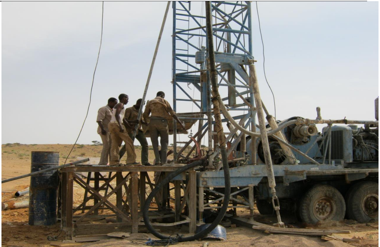
Pipe and pump installation NAF borehole Near Garowe Airport getting contracts from Nugal Animal Farm (NAF) during prolonged droughts 2011.