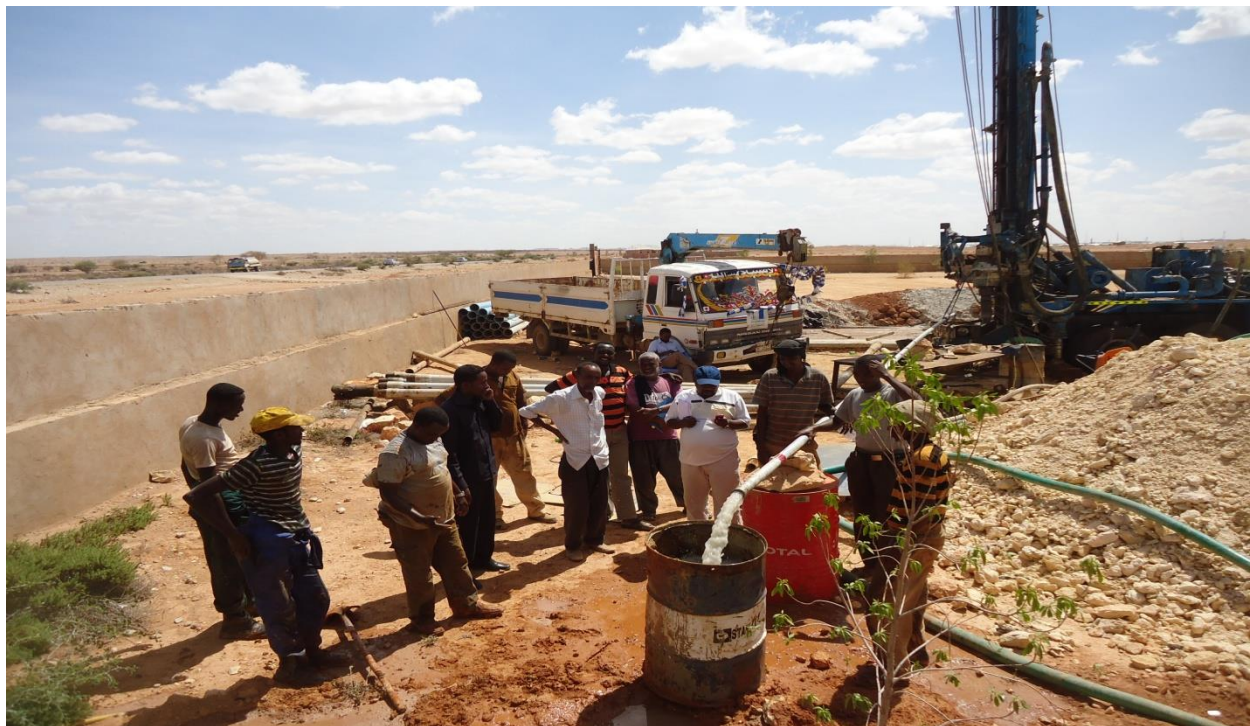
During Completion Al-Naciim Water Company Borehole April, 2013 .