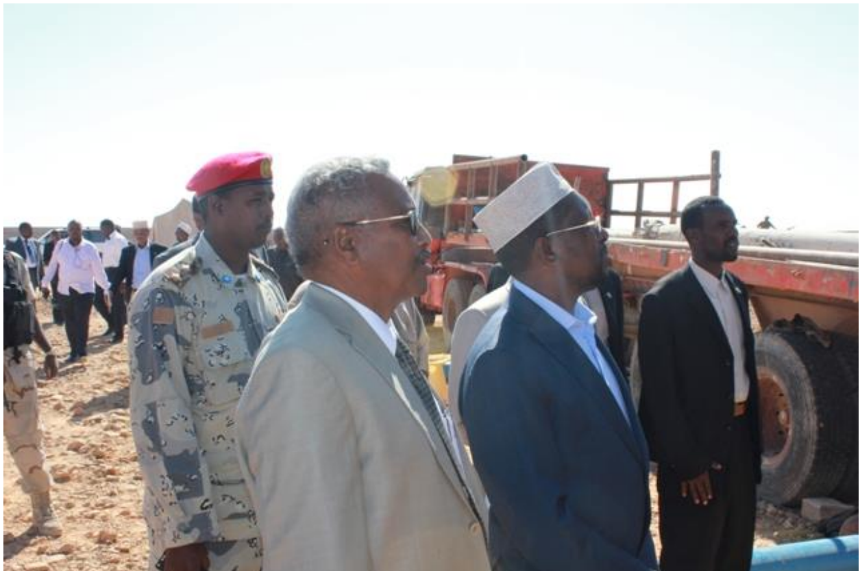
Somalia Ex President Sharif and Puntland President Farole at that Visited Nuwaco Drilling and Construction Company operations Bh site during completion New borehole in Puntland State house year 2012 at Garowe; puntland –Somalia