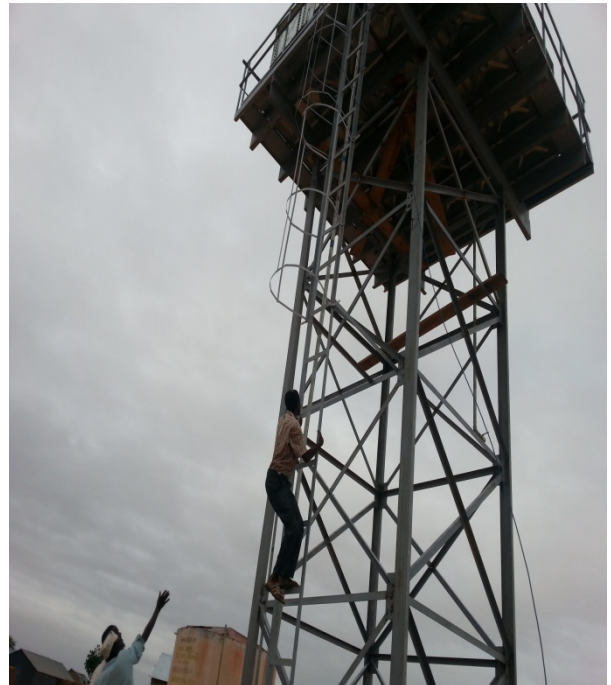
Elevated Steel Water tank Construction Four locations in puntland