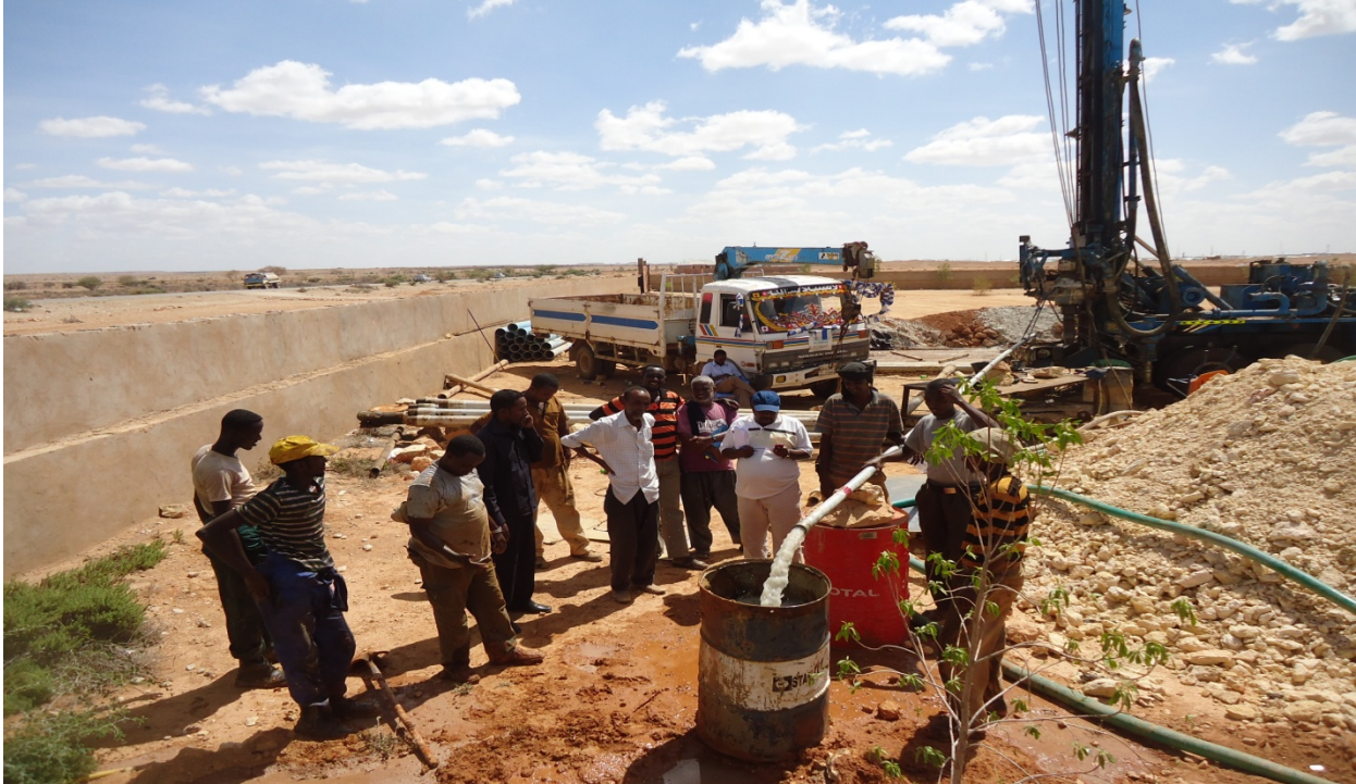
During Completion Al-Naciim Water Company Borehole April, 2013 .