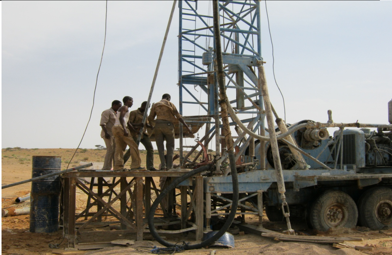
Pipe and pump installation NAF borehole Near Garowe Airport getting contracts from Nugal Animal Farm (NAF) during prolonged droughts 2011.