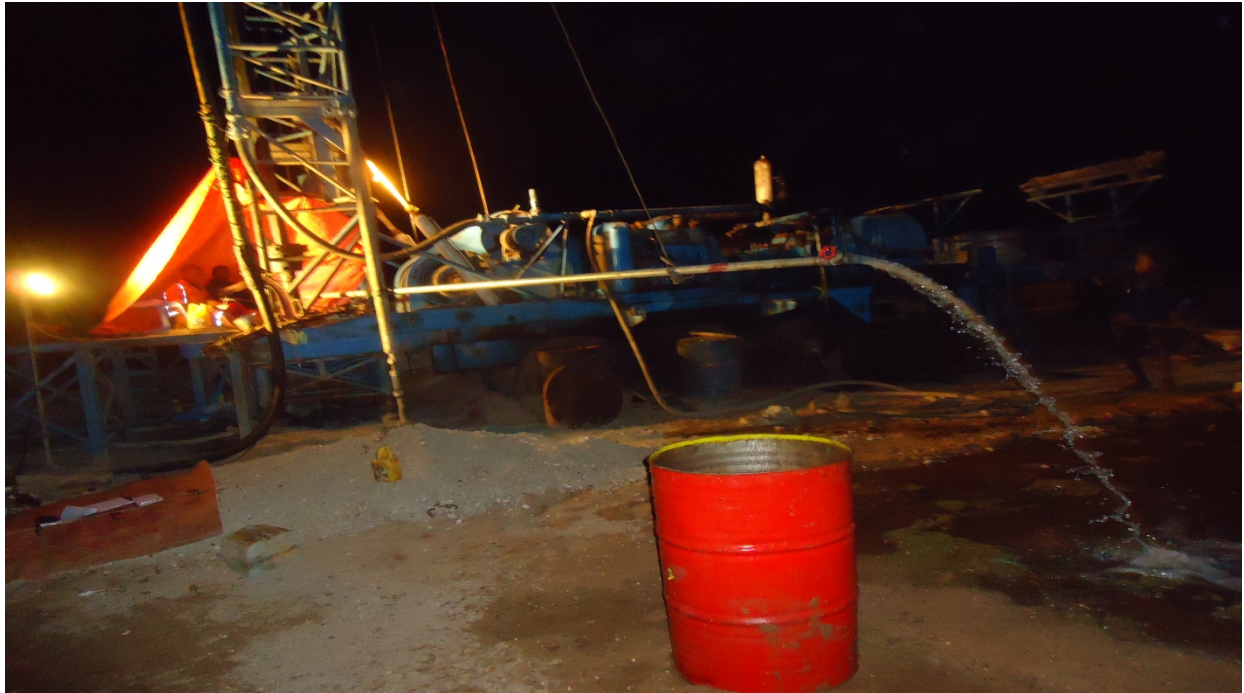
Awrculus Borehole, During pump Test process 253m deep and yield of 11m 3 funded by ICRC