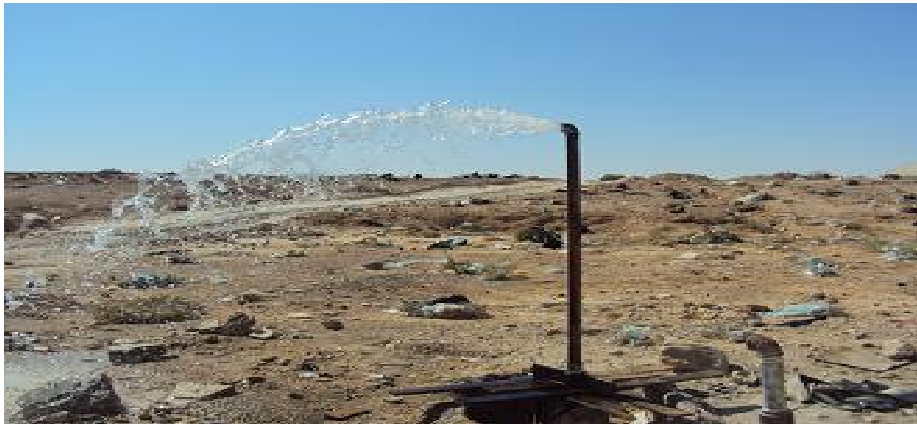
Pump test process