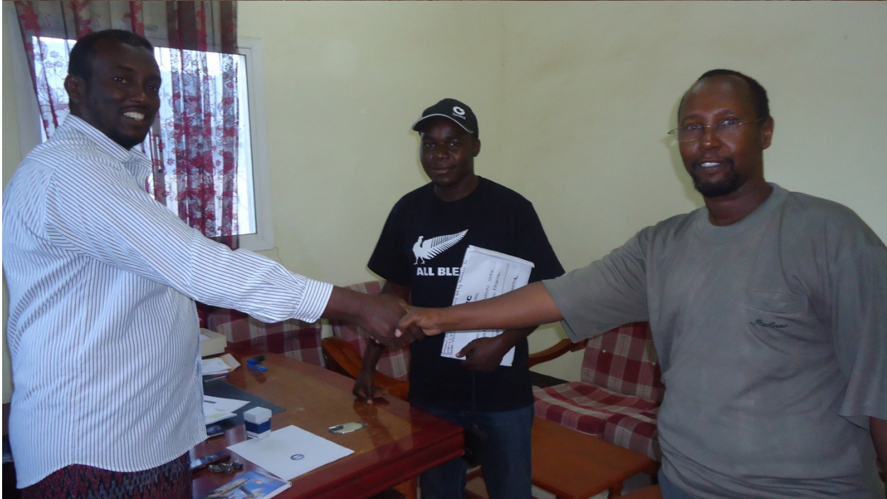
Awrculus Borehole Contract Agreement signing funded by ICRC