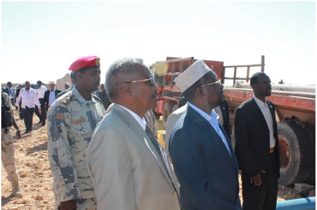
Somalia Ex President Sharif and Puntland President Farole at that Visited Nuwaco Drilling and Construction Company operations Bh site during completion New borehole in Puntland State house year 2012 at Garowe; puntland –Somalia