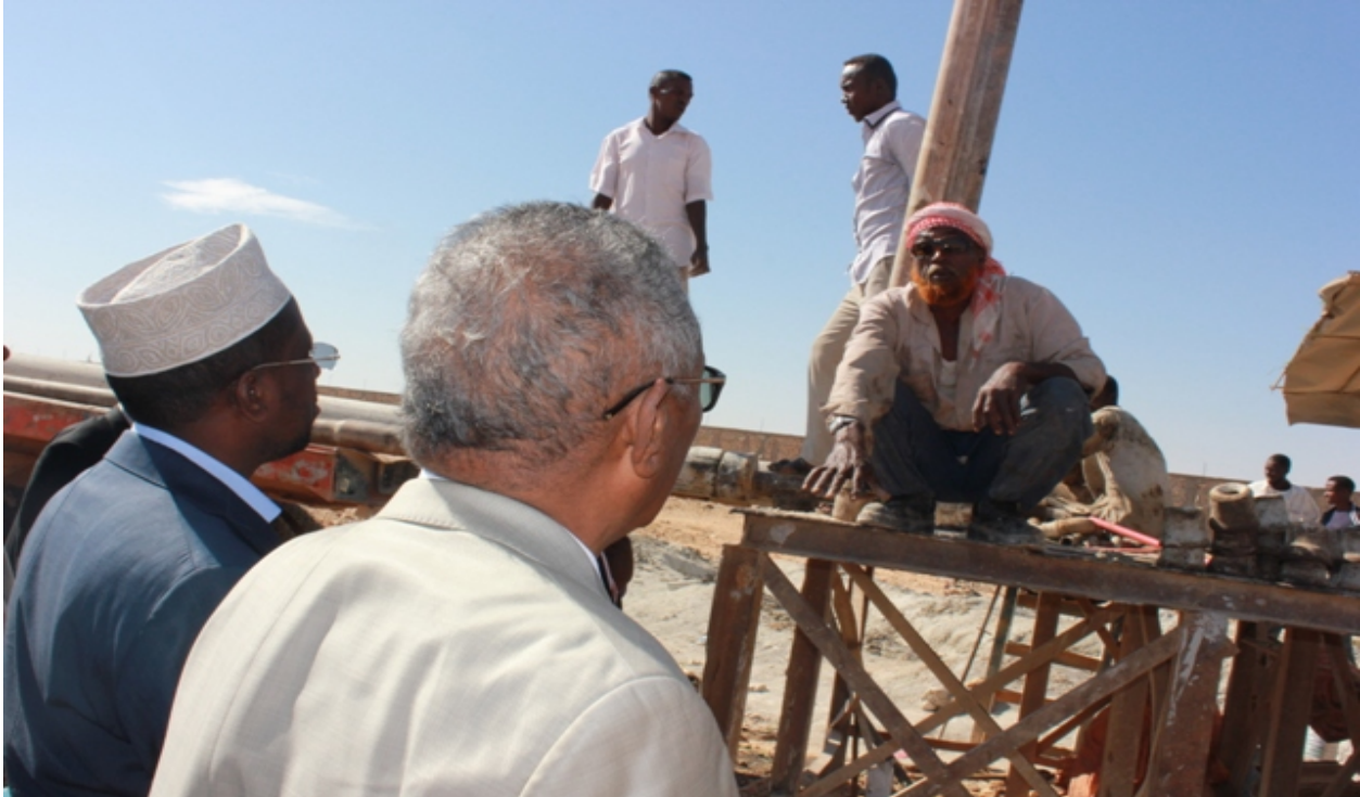
Somalia Presents left punt land president right and Nuwaco head Driller and (operators)