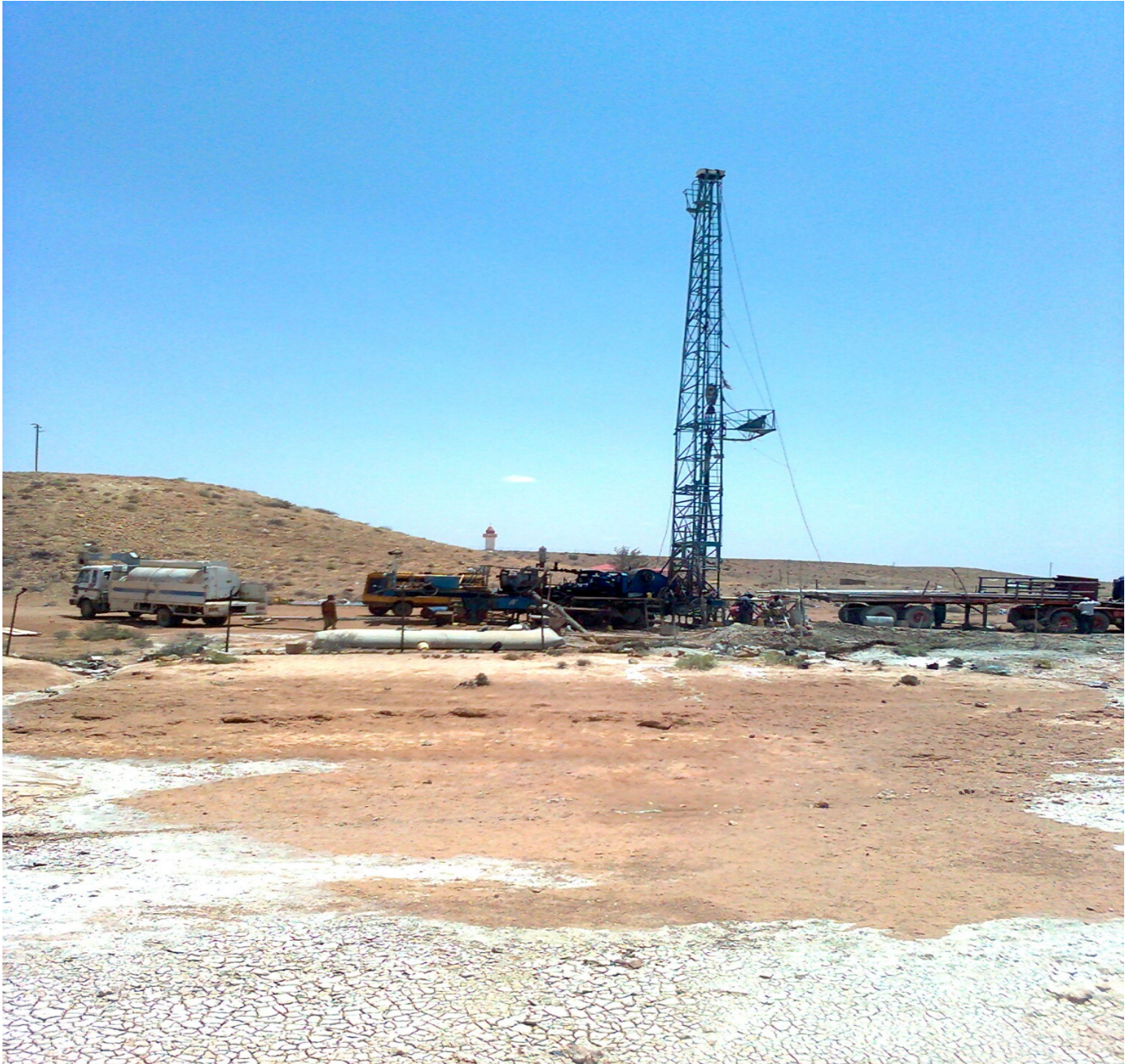
Above picture shows us NUDRICOM Drill Tower ( during Drilling orphanage's borehole 300 meter deep which NUDRICOM drilled Garowe puntland Somalia)