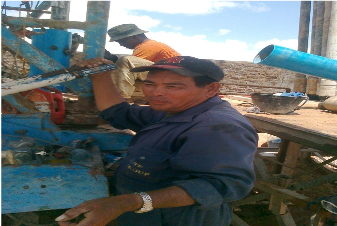
Above picture shows us one of the highly qualified & experienced Nudricom Drill Staff during Supply and Installation of PVC casing for Huruse&Bross Properties Ltd's Borehole Garorwe punt land